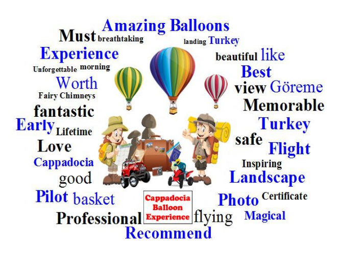
Figure 1.The Most Frequent Words Used in Cappadocia Balloon Experience Reviews