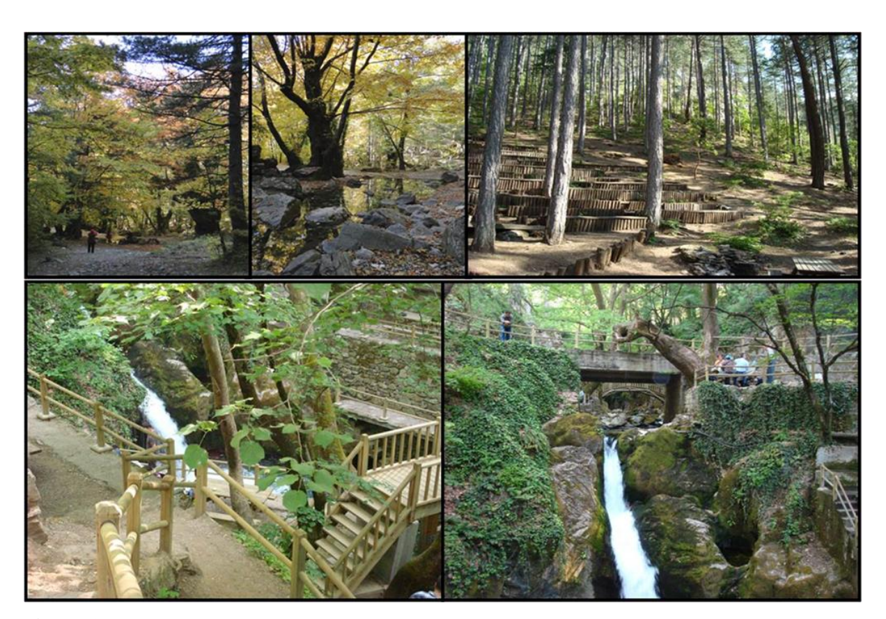
Figure 2 . Waterfall and various images from the study area (Original, 2017).

and a higher rate of cloudiness in comparison with the actual Mediterranean climate. This is a significant factor in recreationally preferring the study area in hot summer months. The study area has visually rich scenic examples together with its rich vegetation besides the brook passing through it and the resulting waterfall (Figure 2). Additionally, ecological tourism activities particularly like trekking in the forest are also among the activities frequently encountered in the area thanks to the richness of the biodiversity.